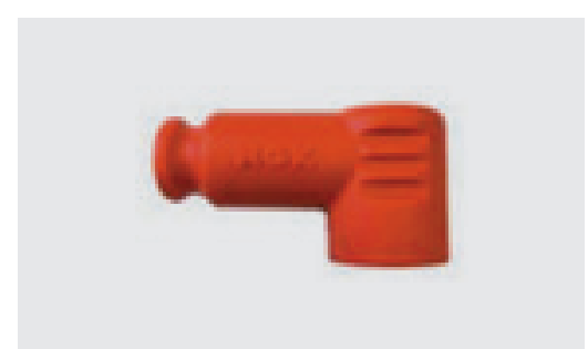
spark plug cap 866707