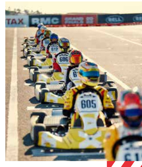
Download the latest Sporting and technical regulations on our website clicking here